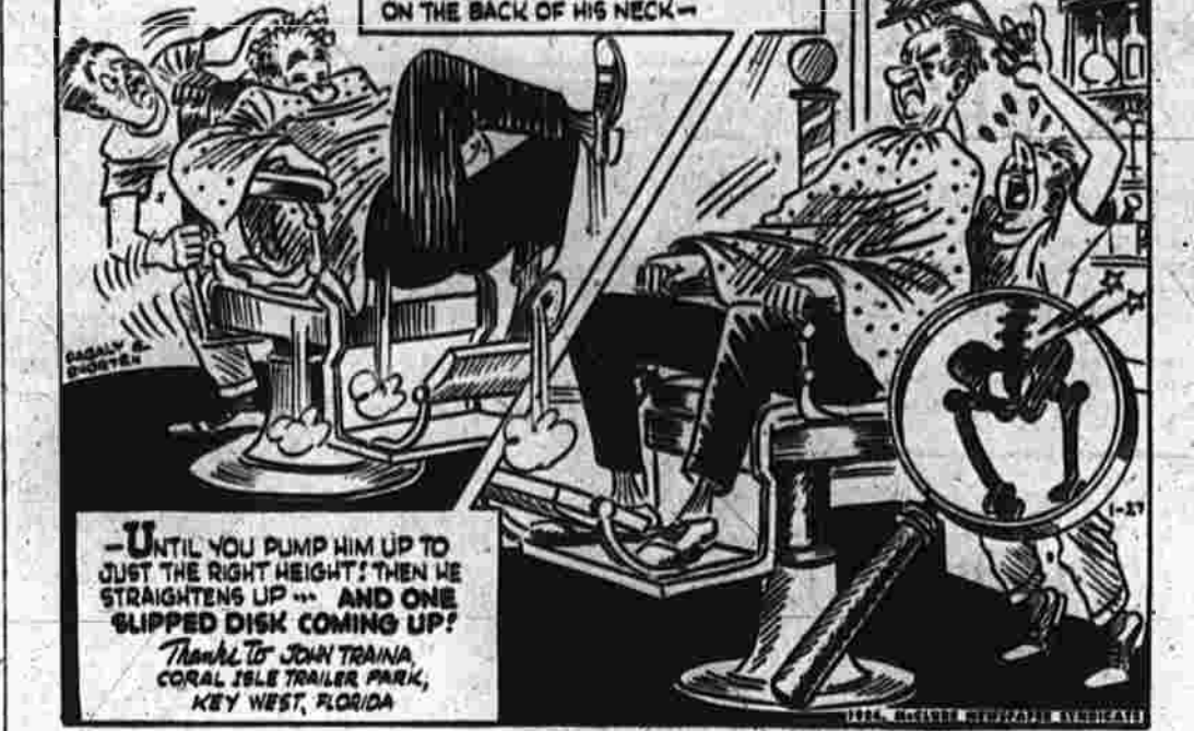
HEADLINE NUMBER 1464 FOR BARBERS—THE GLOUCHER WHO GETS ON THE BACK OF HIS NECK—

WANTED—Machinist. With general all round experience. Complete power and retirement plan, company paid, 40 hour week. Apply.